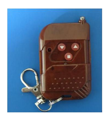
Remote Control Key