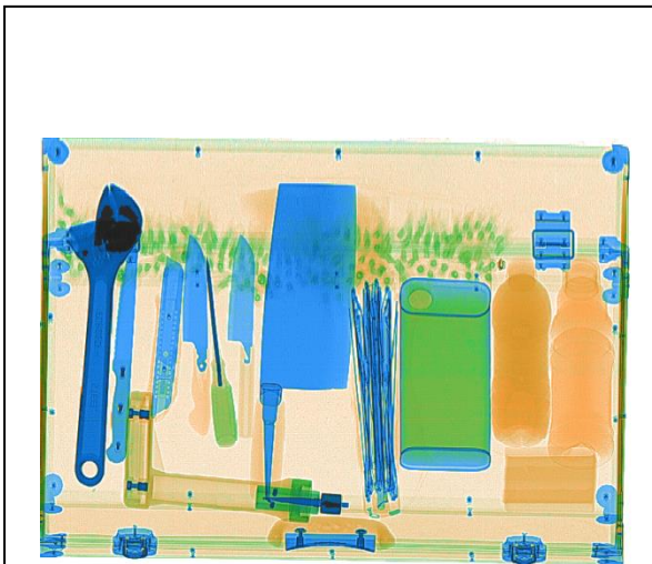
High resolution image