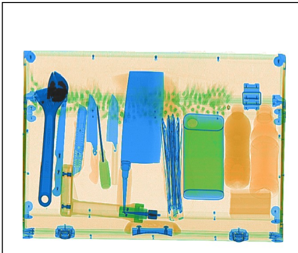
High resolution image