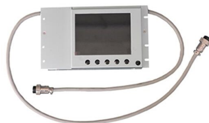
Central Control Unit