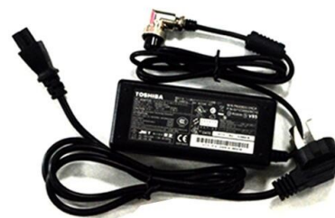
Power Supply Adapter